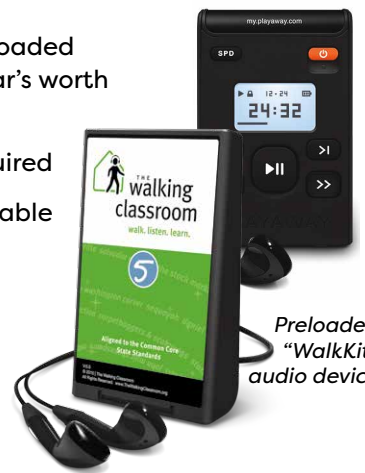
Preloaded "WalkKit" audio device

"Thank you for creating a fun and engaging curriculum that doesn't waste time or take extra effort. Thank you for aligning to my standards. Thank you for integrating science and social studies topics. Just... thank you."