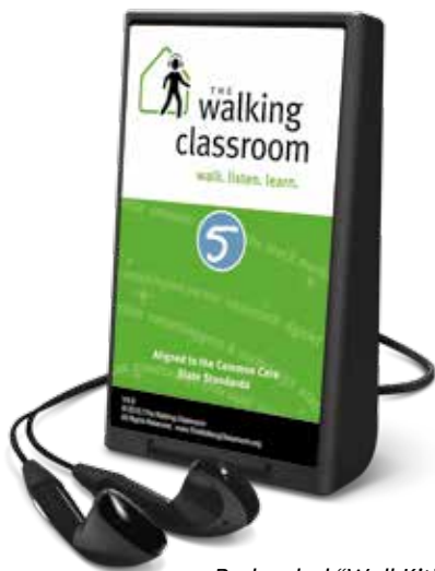
Preloaded "WalkKit" audio device